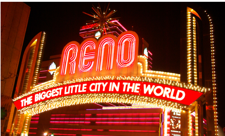
Reno sign greets gamblers and singers to test their luck.