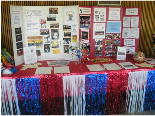
Capitolaire's Display for Rock & Roll Show, 2009