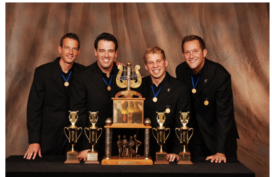
OC Times, winner of 2008 International Quartet Contest

Coming events will be added to future newsletters.